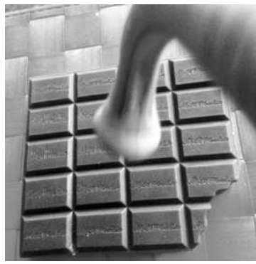
A notepad that's not really a candy bar, plus an elephant trunk for your finger: We're all about practicality in our prizes.

THE STYLE CONVERSATIONAL The Empress's weekly online column discusses each new contest and set of results. Especially if you plan to enter, check it out at wapo.st/styleconv .